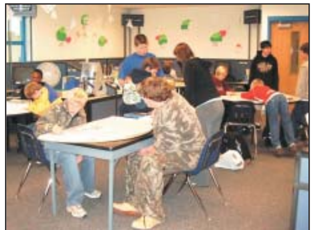
Hamilton-Holmes Middle School River Rats Club members work on designs for water trail kiosks.