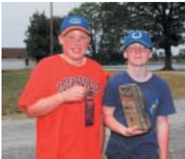
These scouts won one of the prizes for the most unusual piece of trash found at the 2007 River Stewardship Day. What will they find this year?

Come spend the day on the river with some fun people! 18th Annual River Stewardship Day June 7