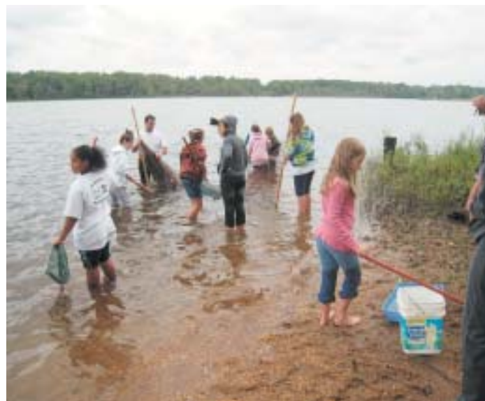
Hamilton-Holmes sixth-graders make a river connection at Sandy Point State Forest on River Day.

Activities: Repair, maintain and clean up kiosk sites on a regular basis; recruit and coordinate volunteers to adopt kiosk sites; work with Virginia Dept. of Forestry to maintain and improve Sandy Point State Forest and coordinate group camping there; install new kiosks (Meadow Farm Event Park state fair site).