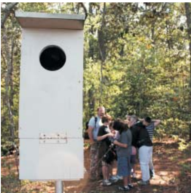
The Bird/Wildlife committee will continue to build, install and inventory bird boxes, like this wood duck box at Sandy Point State Forest.

Activities: Coordinate a River Day for middle school students, partner with 4-H to hold a summer river camp, coordinate at least one educational paddle.