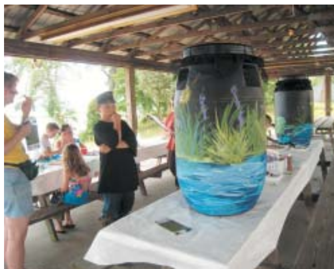
A rainbarrel workshop was one of the stewardship activities during River Stewardship Day.